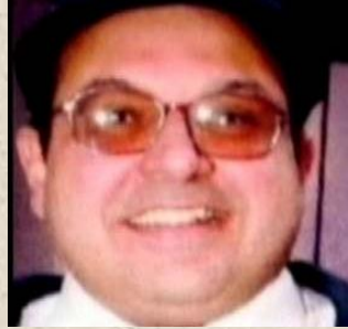
The Hon'ble Justice Rohinton Nariman BCom Hons SRCC LL B CLC Solicitor General of India 2011 – 2013 Judge Supreme Court of India since 2014