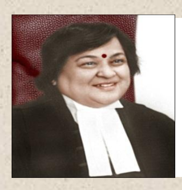
The Hon'ble Justice Gita Mittal BA Eco H 1978 LSR LLB 1981 CLC Acting Chief Justice 2017 – Delhi High Court Judge 2006 – 2017 Delhi High Court

The Hon'ble Justice Tinliangthang Vaiphei LLB CLC 1979 Chief Justice since 2016 Tripura High Court