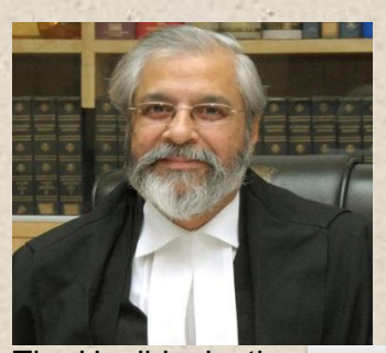
The Hon'ble Justice Madan B Lokur BA His Hons 1974 St Stephen's LLB 1977 Judge The Supreme Court of India since 2012